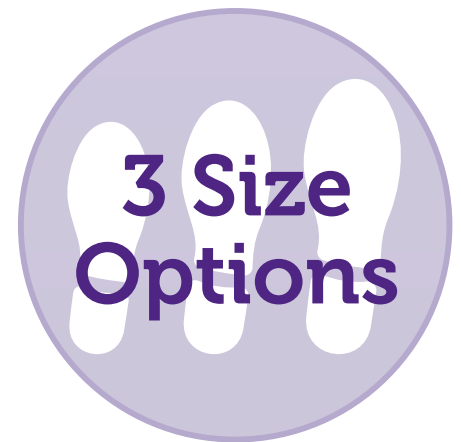
Available in 3 sizes.