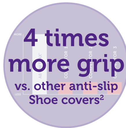
More Grip = Less Slip