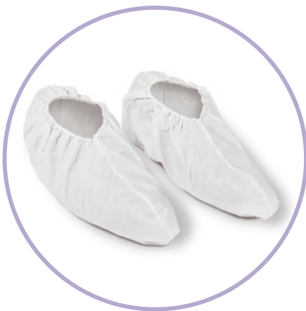
UNITRAX® Universal Traction.

KIMTECH PURE® A8 UNITRAX® Shoe Covers provide superior traction on a wider range of surfaces.