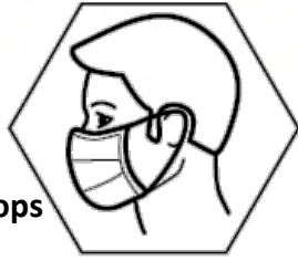
With Ear loops